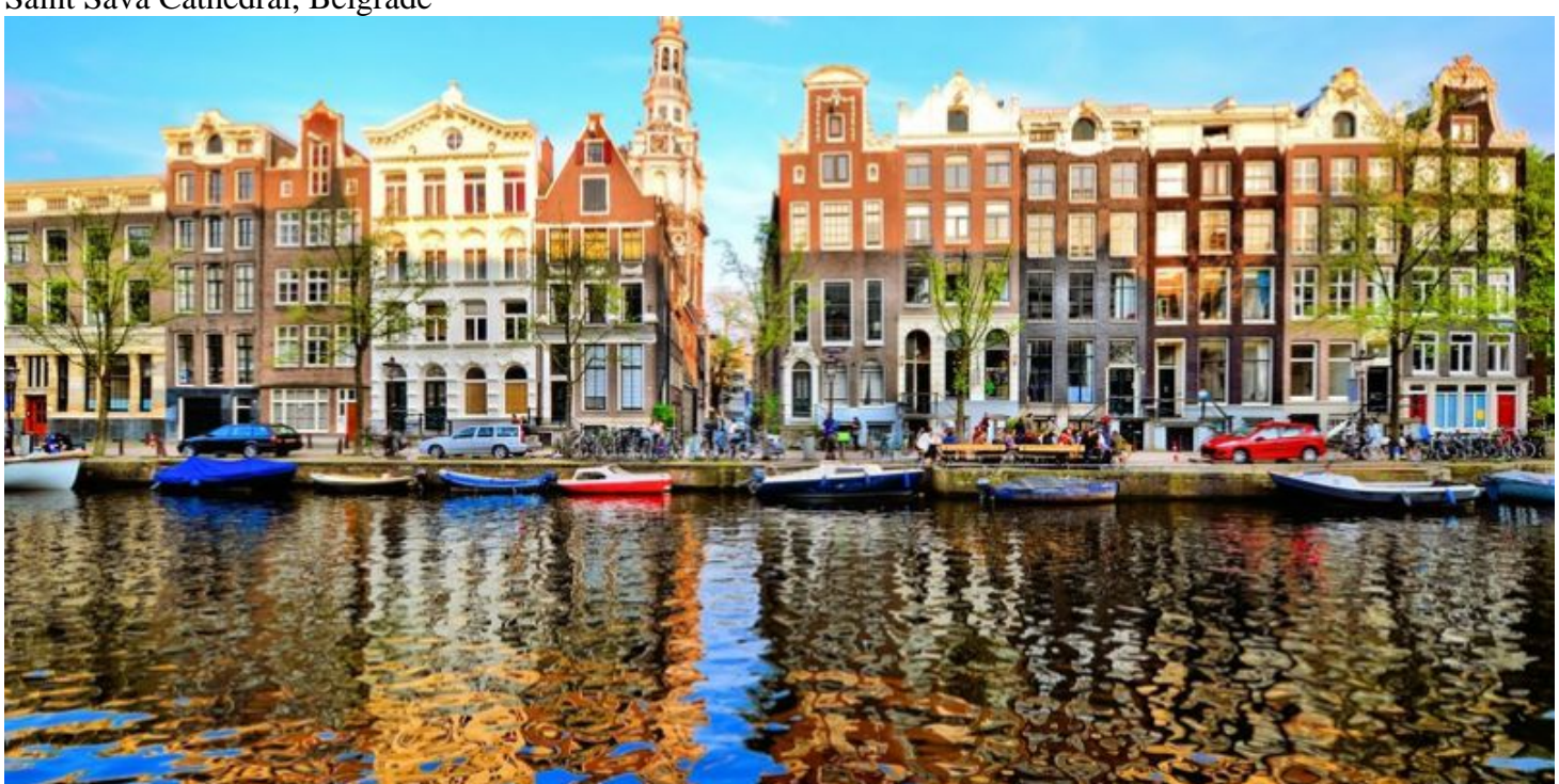
Canal houses of Amsterdam