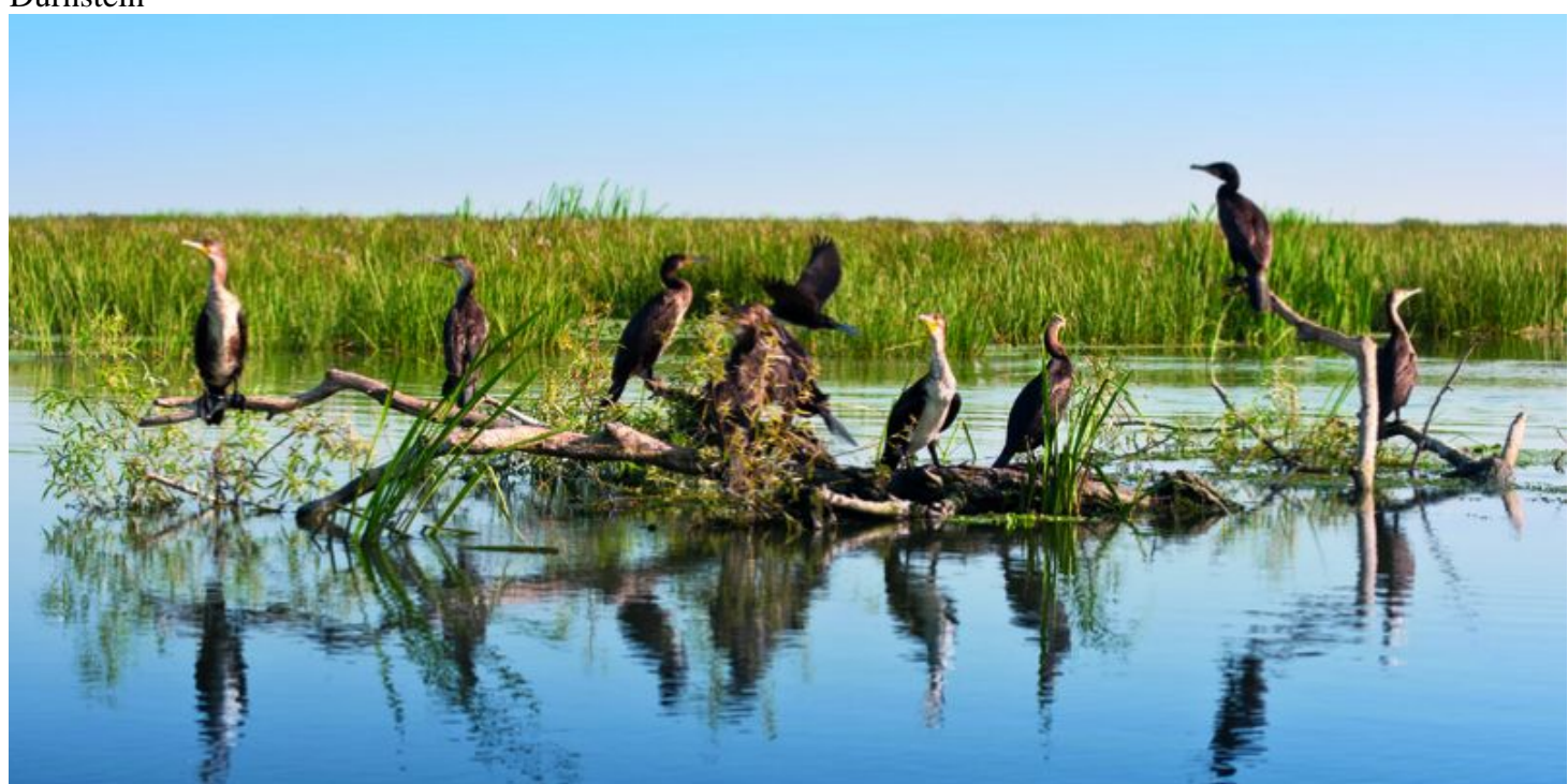
Great Black Cormorants, Danube Delta