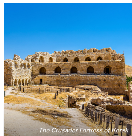
The Crusader Fortress of Kerak

Drive (with luggage) south to Kerak to visit the magnificent 12th-century Crusader fortress built by King Baldwin I of Jerusalem in 1142 AD and featured in legendary battles between the Crusaders and the Islamic armies of Saladin.