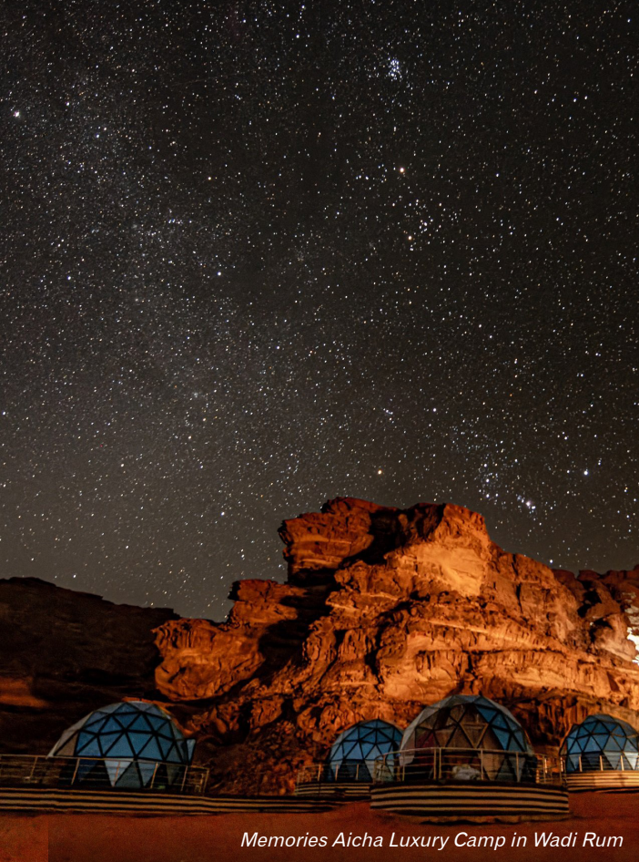
Memories Aicha Luxury Camp in Wadi Rum