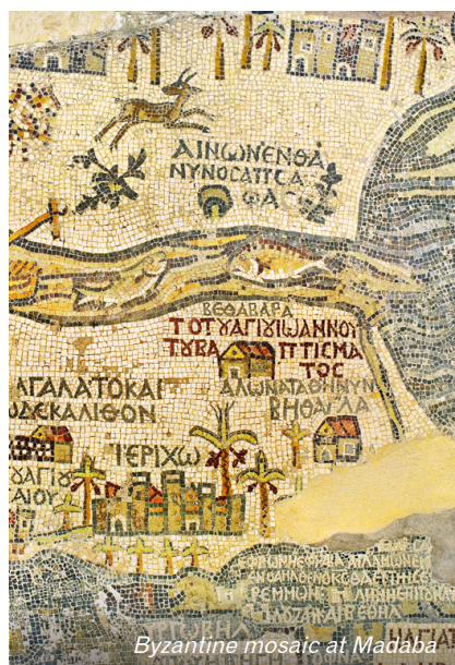
Byzantine mosaic at Madaba

Lunch at Haret Jdoudna restaurant, serving traditional Jordanian home-made dishes. Return to Amman for an afternoon at leisure. Dinner at Jafral restaurant.