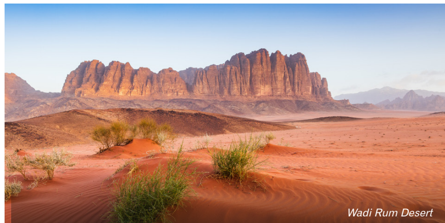
Wadi Rum Desert

Lunch in Kerak, before continuing to the ruins of the early 12th-century Shobak Castle, formally known as 'Mons Regalis', named in honour of the king's own contribution to its construction. Continue along the Desert Highway to Petra, a UNESCO World Heritage Site. Check into the Petra Marriott hotel, where three nights are spent. Located a short drive from the archaeological site of Petra, the hotel has spectacular views over the surrounding valley. Dinner in the hotel.