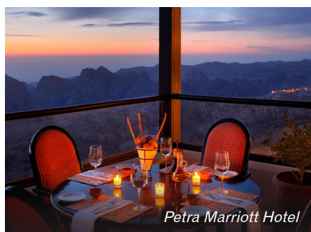
Petra Marriott Hotel

Lunch in Kerak, before continuing to the ruins of the early 12th-century Shobak Castle, formally known as 'Mons Regalis', named in honour of the king's own contribution to its construction. Continue along the Desert Highway to Petra, a UNESCO World Heritage Site. Check into the Petra Marriott hotel, where three nights are spent. Located a short drive from the archaeological site of Petra, the hotel has spectacular views over the surrounding valley. Dinner in the hotel.